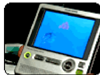
Video, audio players get smaller and more powerful August 5, 2004