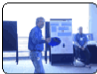
Wireless interoperability in focus at Sun Labs August 5, 2004